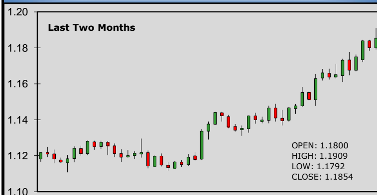
EUR/USD price movements :