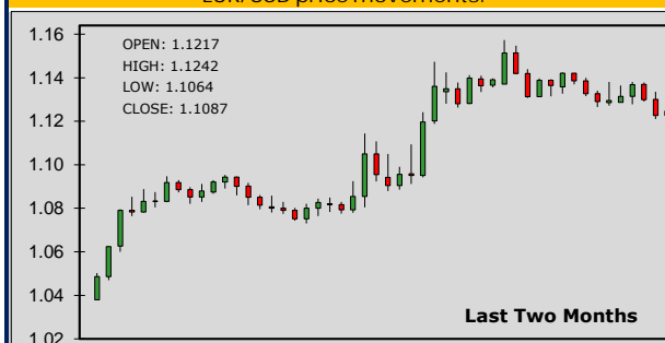
EUR/USD price movements: