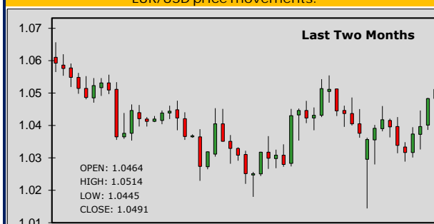
EUR/USD price movements: