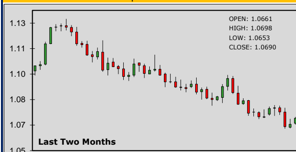
EUR/USD price movements: