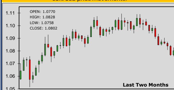
EUR/USD price movements: