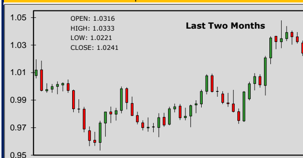
EUR/USD price movements: