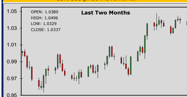
EUR/USD price movements: