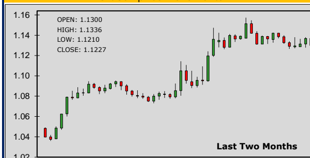
EUR/USD price movements: