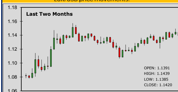
EUR/USD price movements: