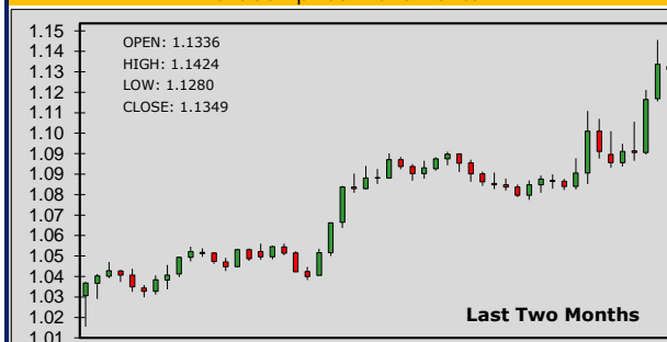
EUR/USD price movements: