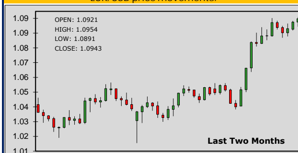
EUR/USD price movements: