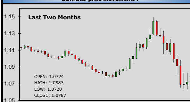
EUR/USD price movements :